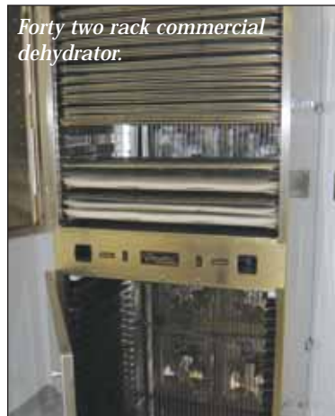
Forty two rack commercial dehydrator.