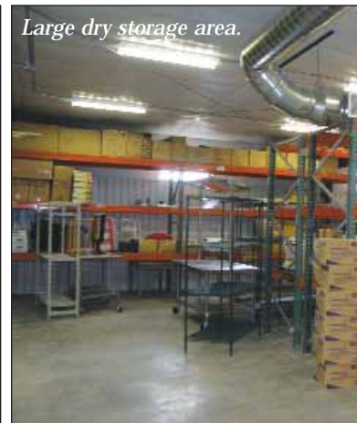
Large dry storage area.