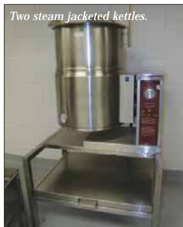
Two steam jacketed kettles.