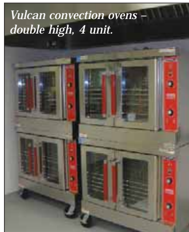
Vulcan convection ovens – double high, 4 unit.