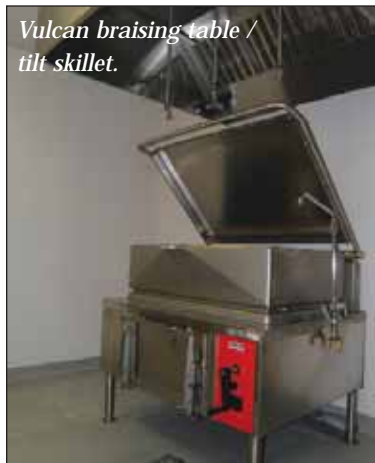
Vulcan braising table / tilt skillet.

The biggest challenge we faced was equipping the kitchen for our use and the use of our community kitchen partners. We sought donations through a Hodan Center Equipment Fund Drive one year ago. All donations were tax deductible to the fullest extent of the law. We are pleased that we had such a tremendous outpouring of support during our fund drive. Because of that support, we were able to equip our kitchen with state of the art equipment that will continue to serve the Hodan Center, surrounding communities and entrepreneurs for years to come. Thank you.