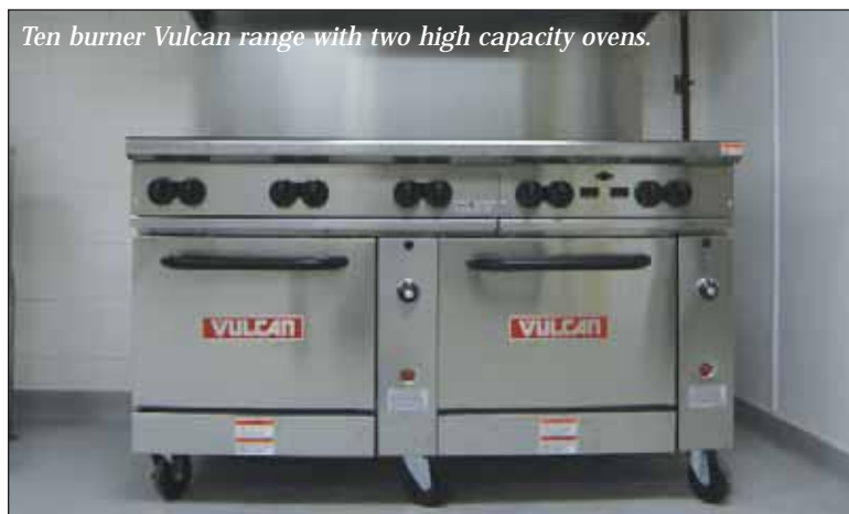
Ten burner Vulcan range with two high capacity ovens.